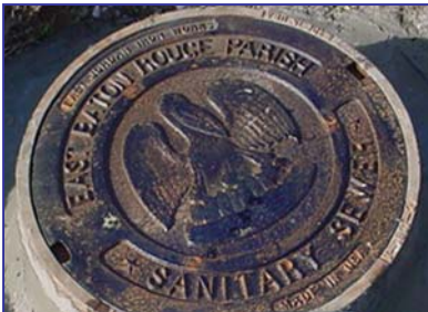
One of the first steps in rehabilitation includes a physical inspection of manholes and pipes to identify blockages.

Rehabilitation of the sewer collection system is a comprehensive physical process that begins with cleaning and inspection of sewer pipes and manholes. Typical rehabilitation repairs include pipe and manhole replacement and trenchless technologies that minimize above ground disturbances, such as cured-in-place pipe liners.